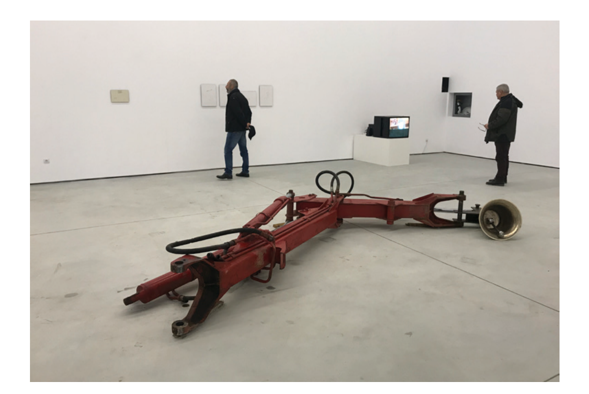
Photo: Ciprian Muresan On the sex of angels Nicodim Gallery 2017 Bucharest, Romania

2017 bell, excavator arm, metal and drawings installation / performance variable duration variable size