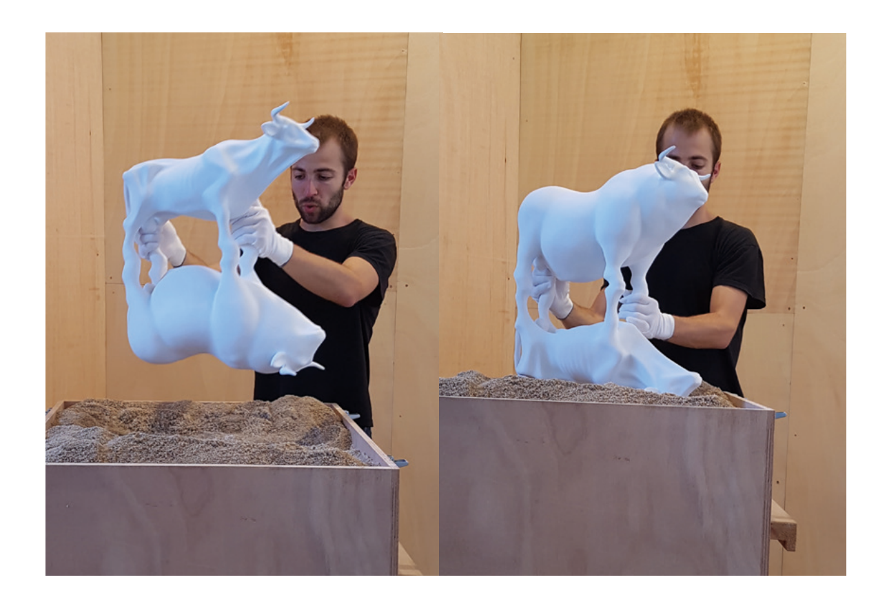
JosédelaFuente Gallery / Estampa 2016 / Matadero Madrid 2016 Madrid, Spain

2016 Performance Installation variable duration variable size