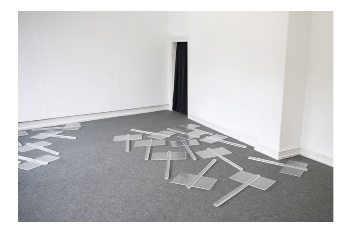
Silent Condition. Enric Fort Ballester Kunstverein Wolfenbüttel 2017 Wolfenbüttel, Germany

2016 - 2017 performance installation variable duration variable size