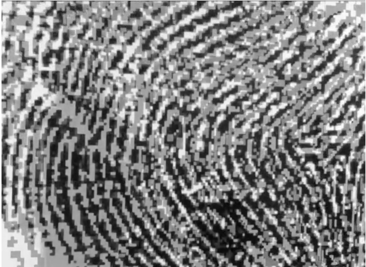
Nita Tandon, Fingerprint Erased (2010)