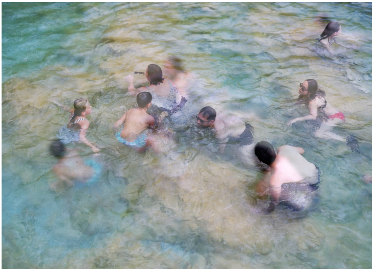
Sula Zimmerberger, The Sublime bird (2022)