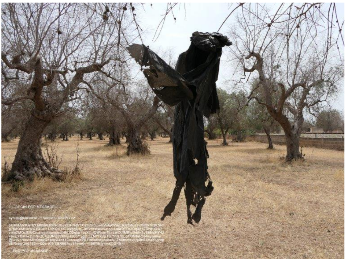
Casaluce Geiger, @repost #breath (2022)