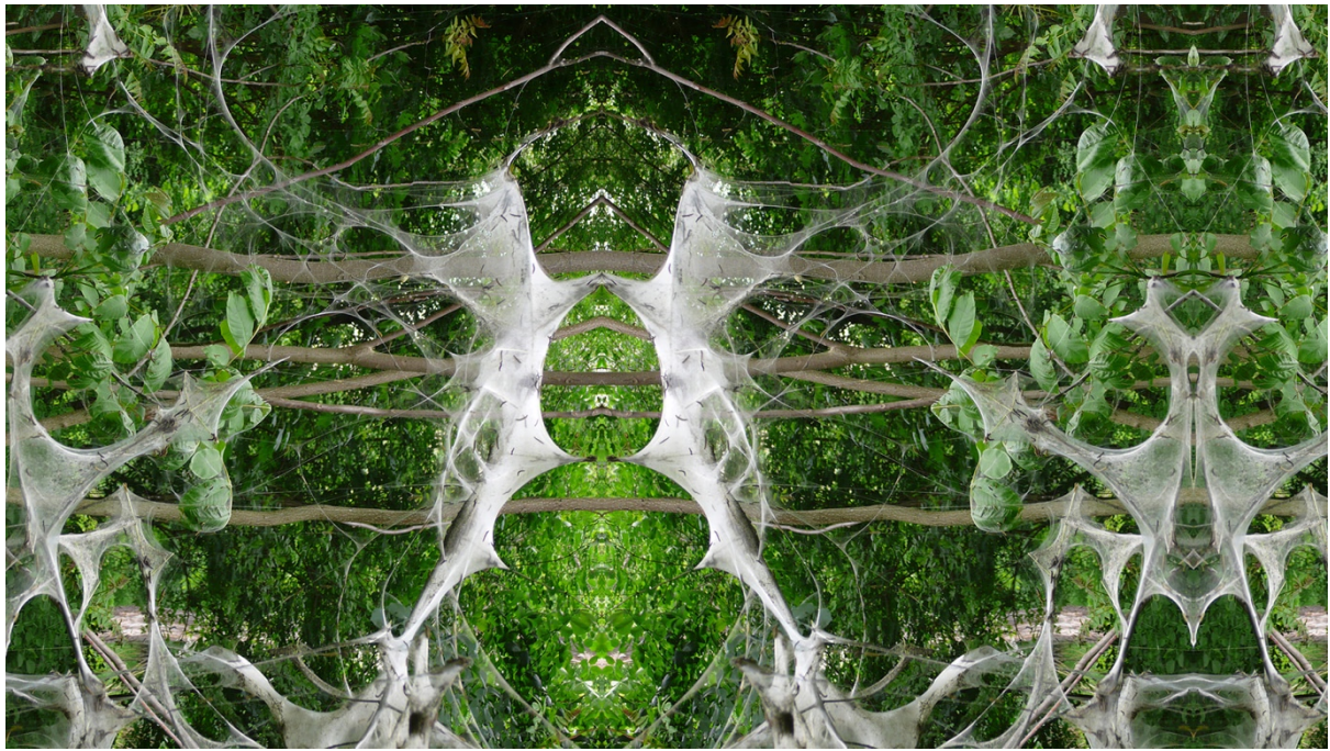
Ilse Chlan, Glückliche Gespinste (2022)