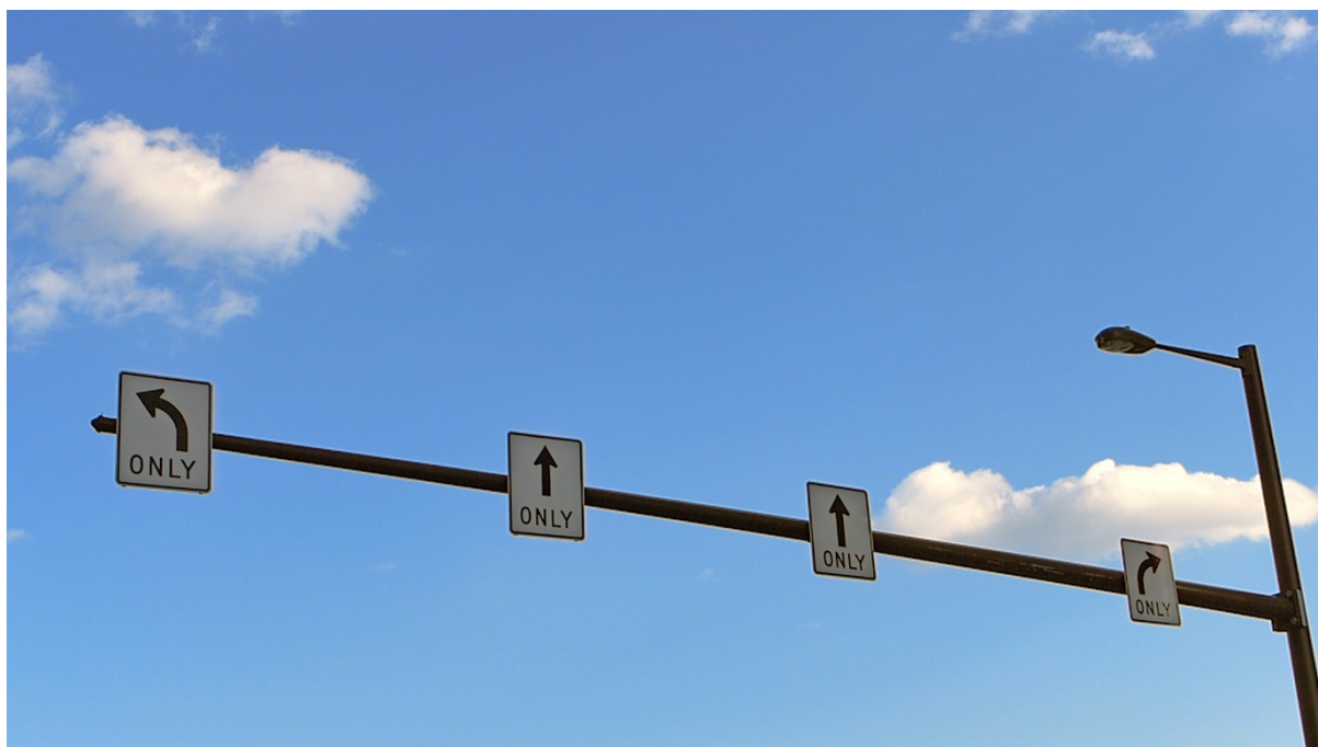
Gerald Zahn, SNOWFLAKES (Episode 1), 2022